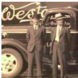
Salesmen, Weston's, Montreal, 1936.