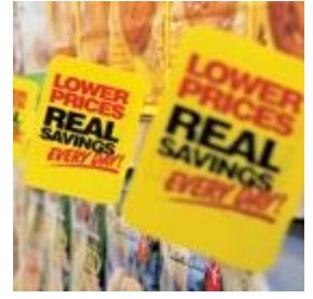
Real savings, Real Canadian Superstore, 2006.