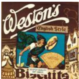
Weston's English Quality Biscuits, 1923.