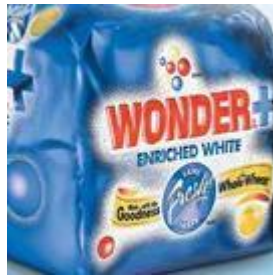
Wonder Plus, Wonder Bread, 2008.