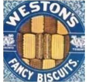
Weston's Biscuits packaging, in-store display, ca. 1920.