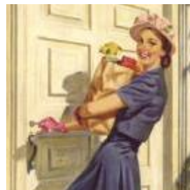
George Weston Limited annual report, 1949.