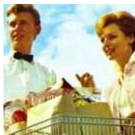
"Friendly Courtesy," Loblaw's, 1965.