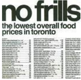
No nonsense, no frills, 1978.