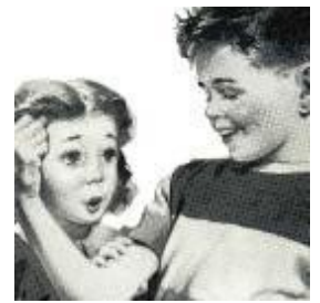
Weston's Enriched Bread, 1953.