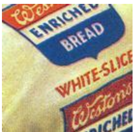
Weston's Bread, ca. 1955.