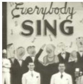
"Weston's Community Sing" radio show, Toronto, ca. 1943.