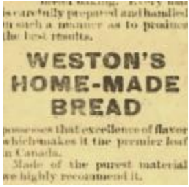
Weston's ad, Evening Star, Toronto, 1902.