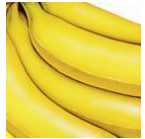
“Won't Be Beat,” nofrills, 2010.