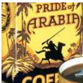
Loblaws' Pride of Arabia Coffee, 1960.