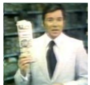
William Shatner, "Come on over to Loblaw's," 1973.