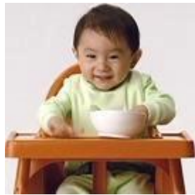
President's Choice organic baby food, 2008.