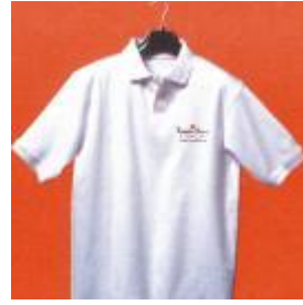
President's Choice Financial – bank smarter and keep your shirt, 2003.