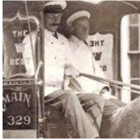
Model Bakery decorative bread wagon, Toronto, ca. 1908.