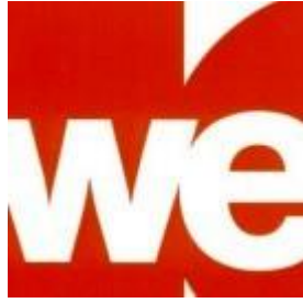
“Weston 100” a century in business, 1982.