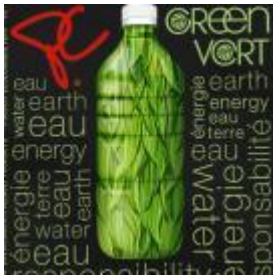
“Canada's Greenest Shopping Bag,” President's Choice, 2007.