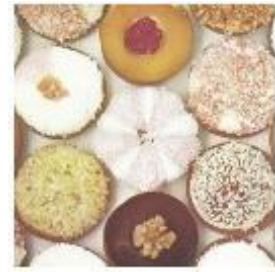
Weston's Biscuits full-colour catalogue, ca. 1920.