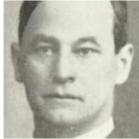
George Weston Limited, advertisement, The Globe, 1911.