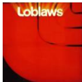
New stores, new logo, Loblaw's rebranding, 1972.