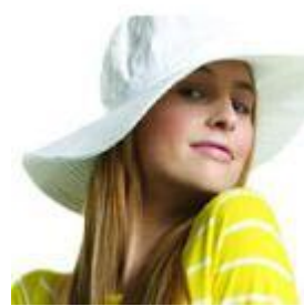
Joe Fresh Style - fashionable without spending a bundle, 2009.