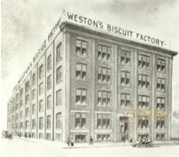
Weston's Biscuit Factory, Peter St., Toronto, 1910.

In 1911, George Weston did something almost unthinkable. He sold the Model Bakery and stopped making his bread.