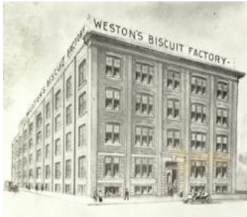
Weston's Biscuit Factory, Peter St., Toronto, 1910.